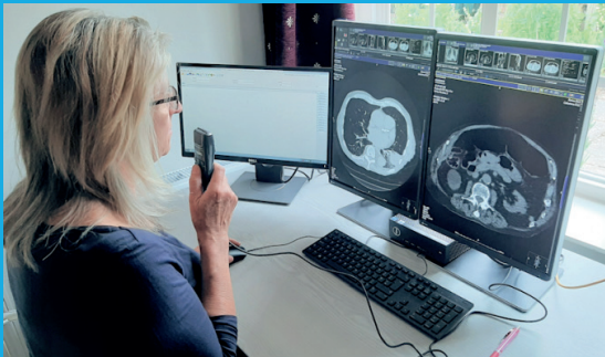
Consultant Vascular & Interventional Radiologist at Worcestershire Acute Hospitals NHS Trust